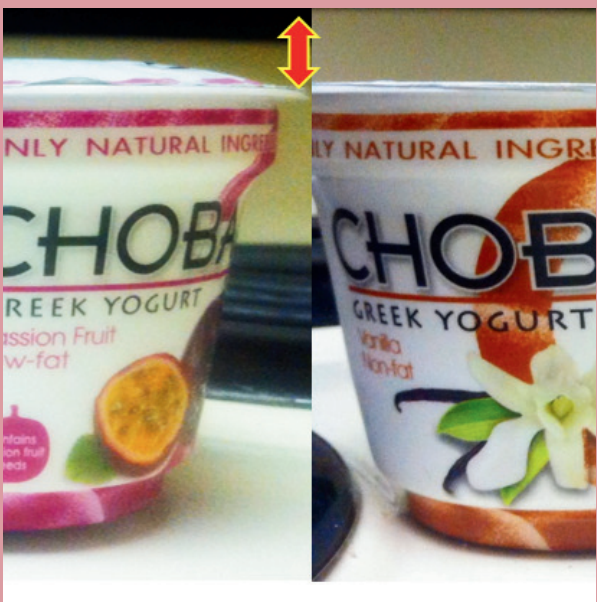
Bulging, leaking, or dented containers