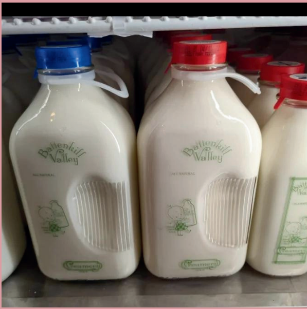
Products in refundable glass bottles